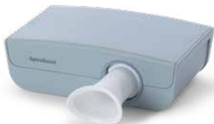
Ultrasound spirometer SpiroScout SP plus

CARDIOVIT CS-104 is also available as resting ECG PC software, with optional stress test and spirometry add-ons.